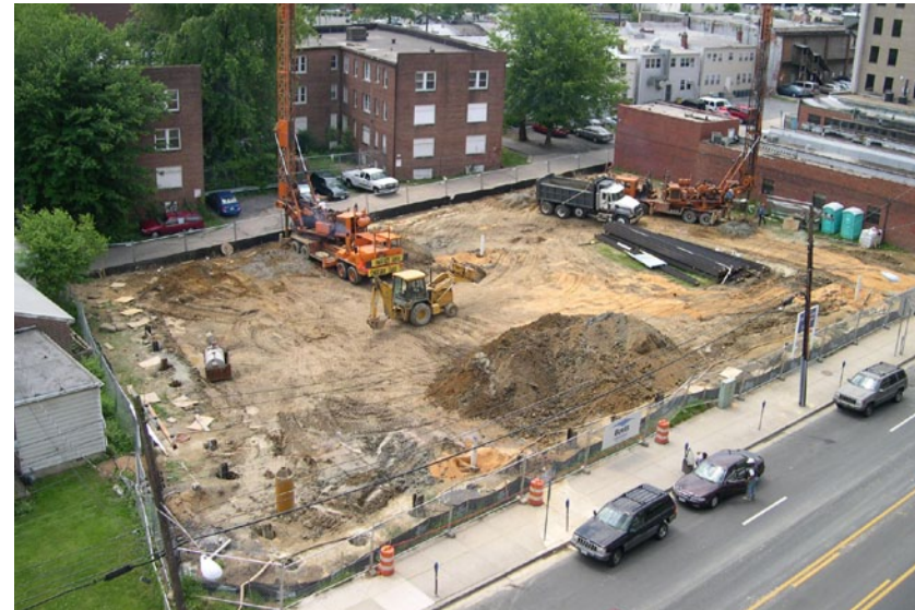
THE ZONING CODE MUST DO A BETTER JOB AT ACCOMMODATING INFILL AND REDEVELOPMENT.

Historically, residential growth in the county has come in the form of one-unit greenfield development between the urban centers and farmland. Opportunities in these areas are disappearing and this pattern must change. Future redevelopment will require creative reuse of under utilized areas such as the approximately 8,000 acres of surface parking lots and strip shopping centers that currently exist in the county. The majority of redevelopment will be built on surface parking and as infill development for houses, multi-unit and mixed-use development. As a result, the rules controlling development must recognize and appropriately respond to the need for infill and redevelopment. The new zoning code must do a better job of accommodating infill and redevelopment while reducing the impact on established residential areas.