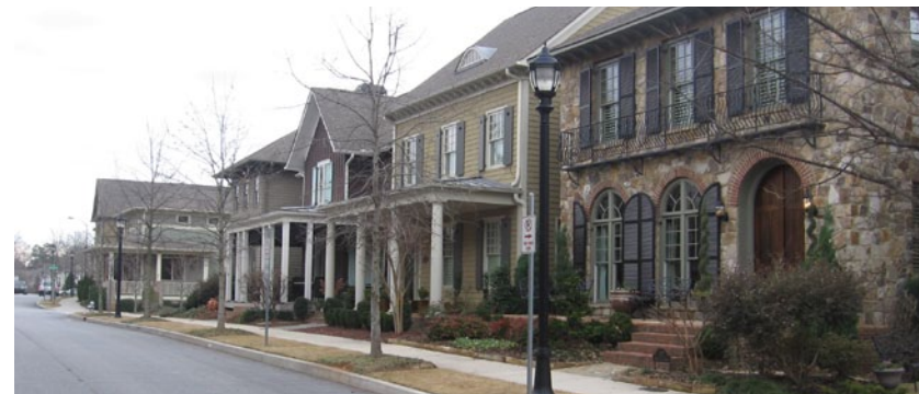
GARAGE PLACEMENT PLAYS AN IMPORTANT ROLE IN ESTABLISHING THE WALKABILITY OF A STREET. THE TOP IMAGE (EPA SMART GROWTH) IS OVER DOMINATED BY STREET-FACING GARAGES. THE BOTTOM IMAGE (GLENWOOD PARK IN ATLANTA) HAS ALLEY- OR REAR-LOADED GARAGES.