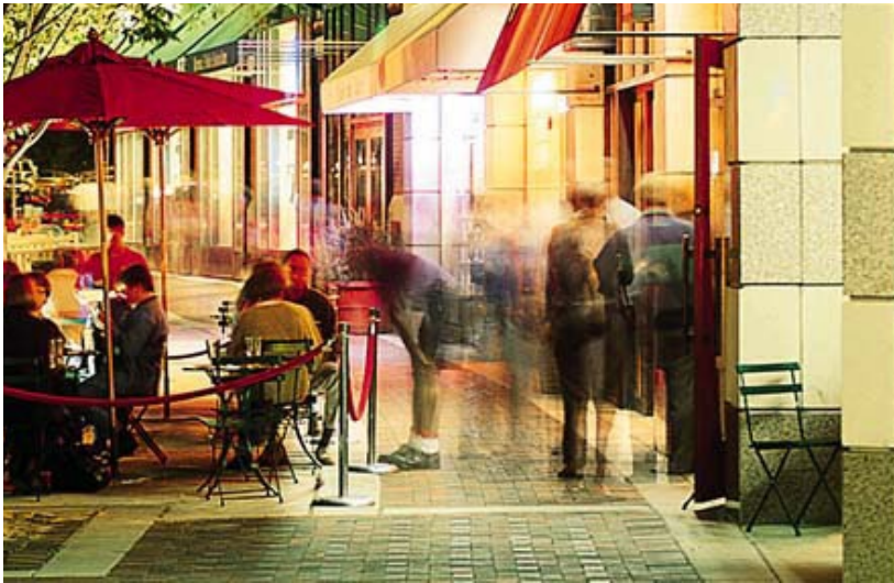
A GAP EXISTS BETWEEN THE COUNTY'S RECENT EFFORTS TO PROMOTE QUALITY DEVELOPMENT AND THE IMPLEMENTING REGULATIONS. THE CURRENT ZONING CODE DOES NOT "BROADCAST" THE COUNTY'S INTENTIONS.

Projects that emulate the county's vision should be the easiest to approve, while projects that fail to advance the vision should be the hardest to approve. The county deserves a high-quality built environment and there are a number of improvements that can be made to the current zoning framework to help realize it.